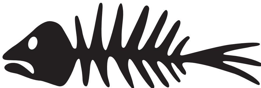
Fish stencil, actual size for armband